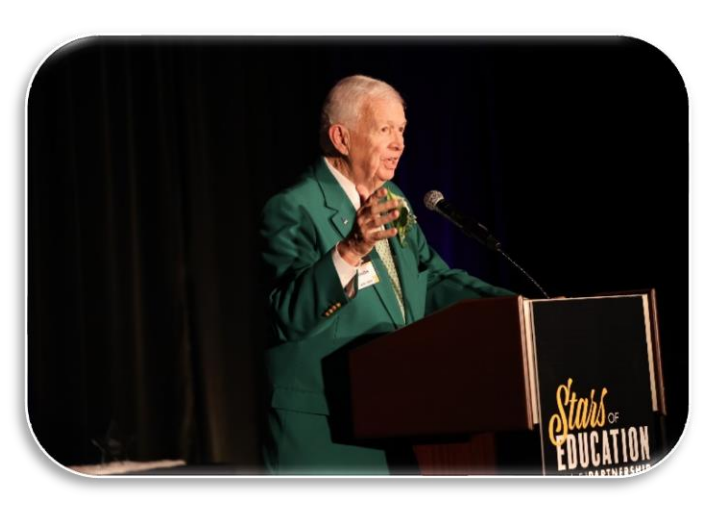
Stars of Education Gala 2023