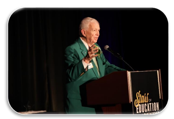
Stars of Education Gala 2023